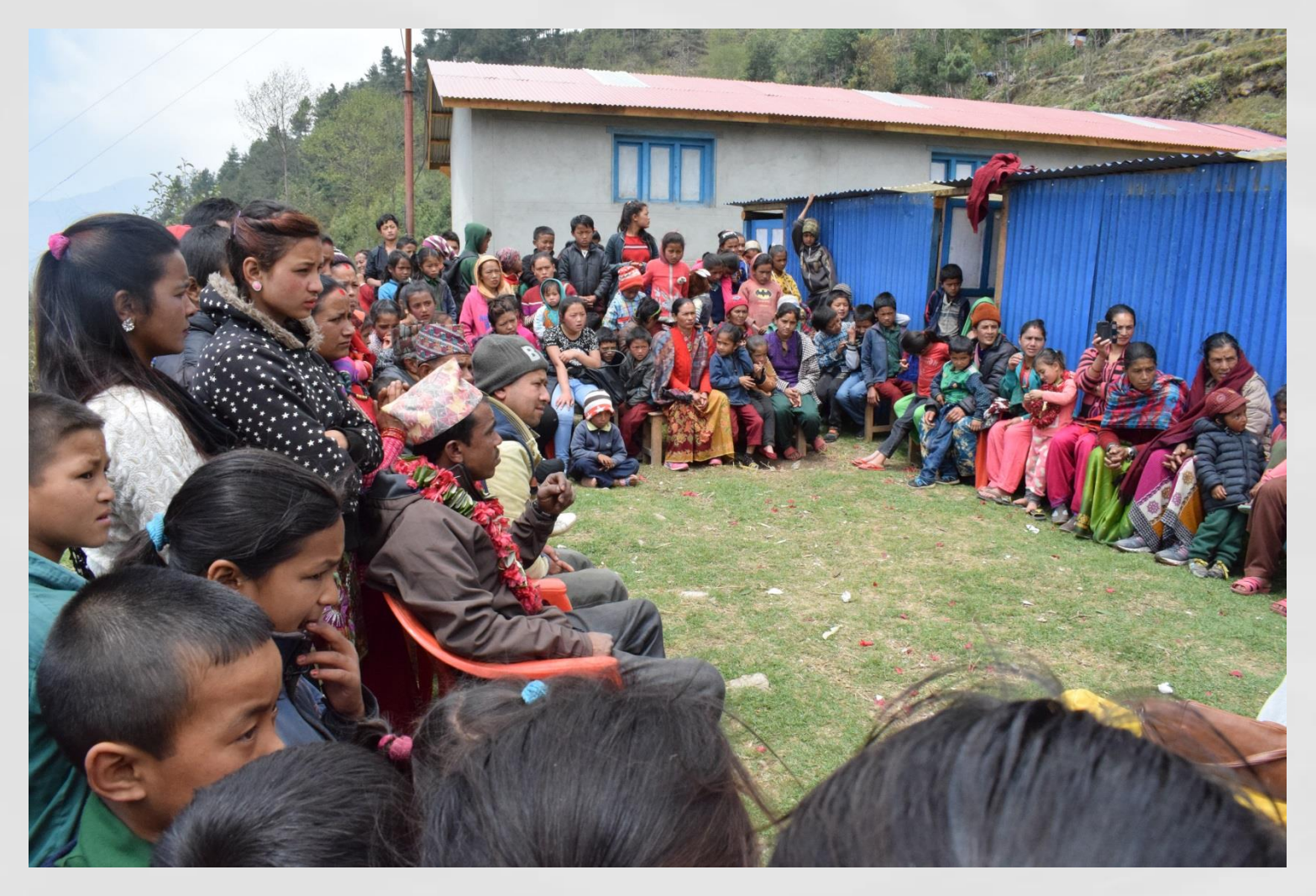
Students and parents waited at the temporary "meeting room" for our arrival