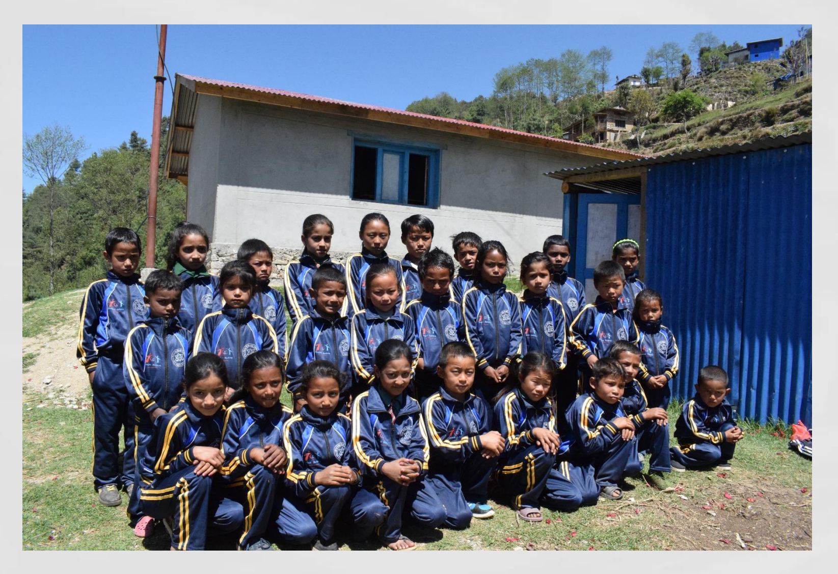
They all have dreams.....You could help them realize their dreams!