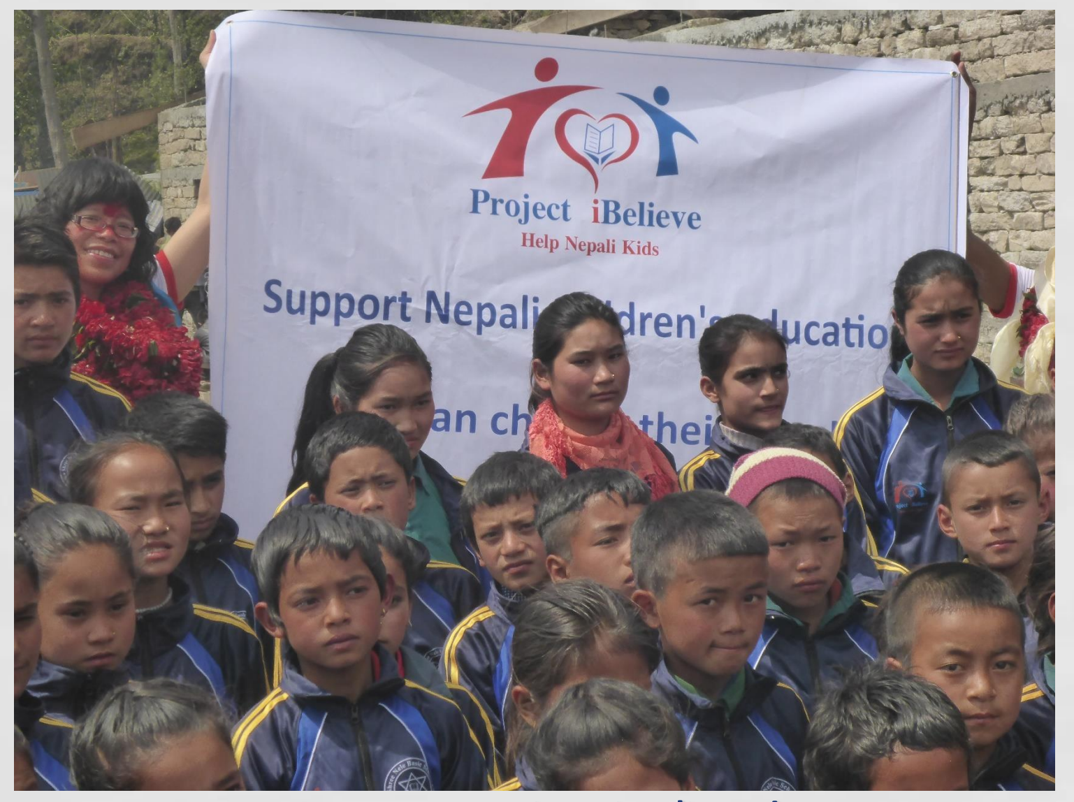
Support Project iBelieve! You will be amazed that a little contribution from you can make a big impact on these kids' lives.