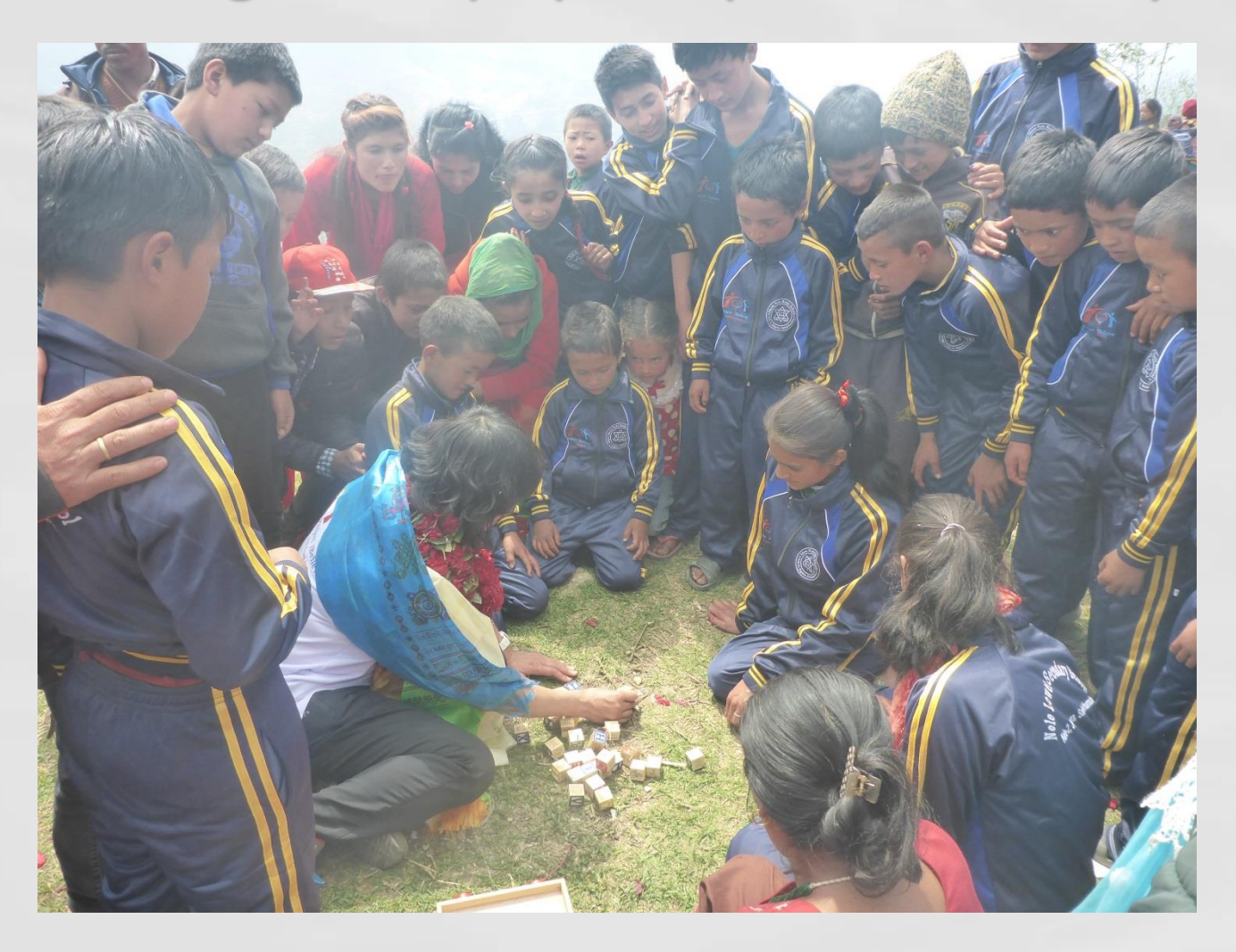
Most of the kids in the school don't have toys