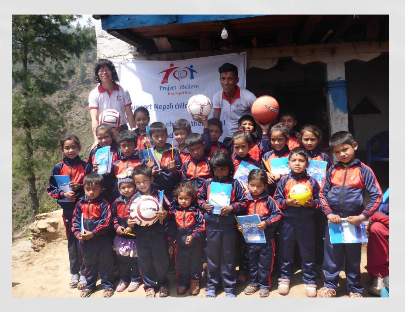
Extend your hand!