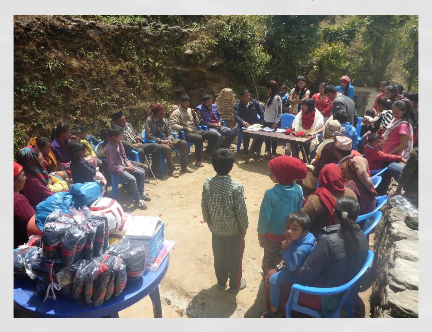
Parents and children gathered at Bal's house